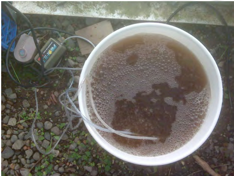
Above: Using air pump for 2 hours